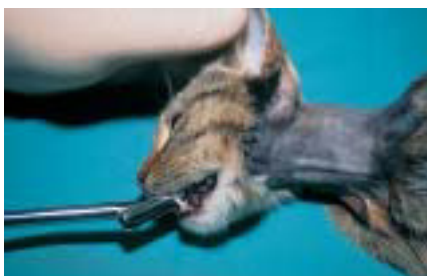
1. Introduce tube into midcervical oesophageal area