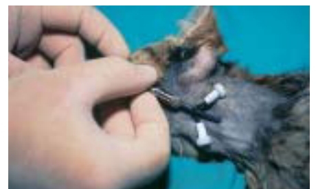
3. Introduce Peel-Away® sheath needle into distal portion of tube