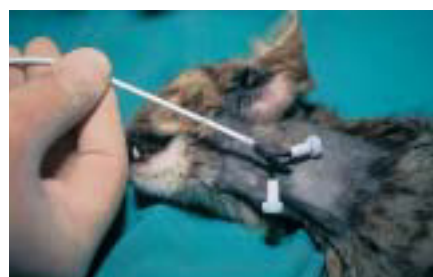
5. Introduce catheter through sheath to the lower third of the oesophagus