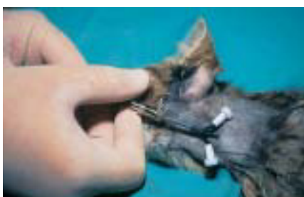
4. Remove needle from sheath