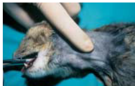
2. Palpate slot in distal portion of tube