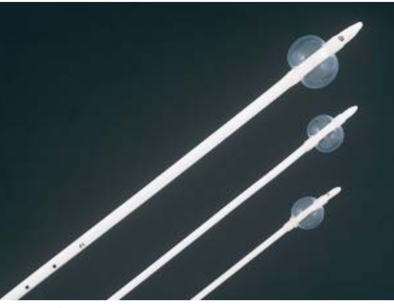
Please note: Only sterile water to be used to inflate balloon