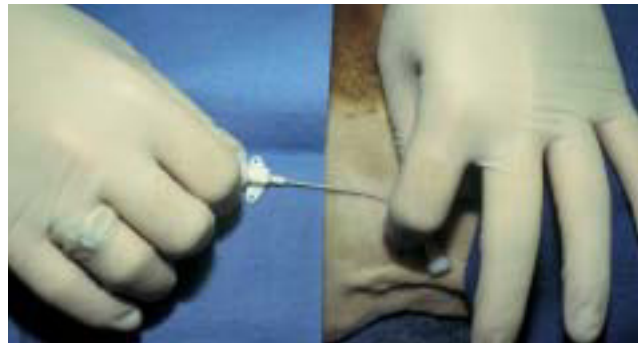
Peel-Away® Technique - Step 3