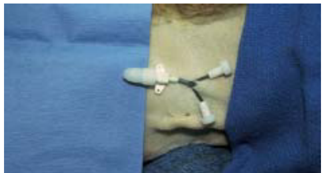
Peel-Away® Technique - Step 4